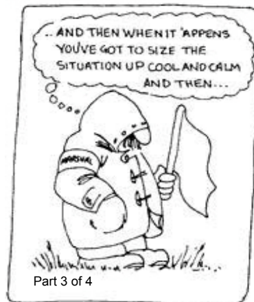
Part 3 of 4