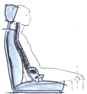
2 Incorrect posture - hips forward straining spine

The CG-Lock, by holding the pelvis firmly back in the seat would appear to align the spine and assist the maintenance of correct posture – significantly reducing back problems. It seems that this is one product that just about every driver/passenger can benefit from. Improving performance on the track and posture on the roads.